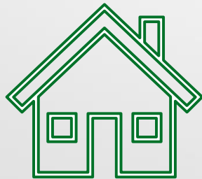
Home educated students