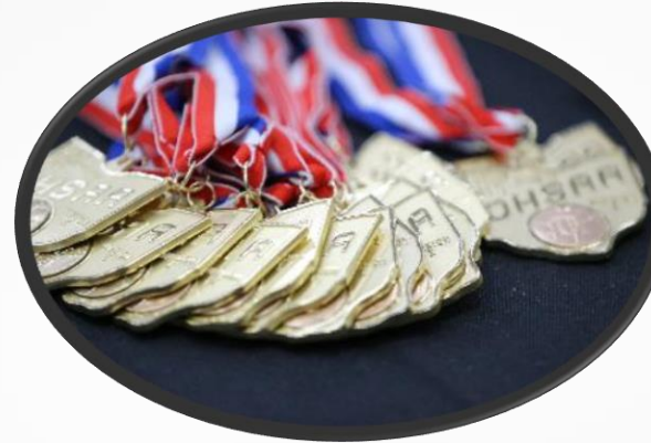
Sport Administration Update