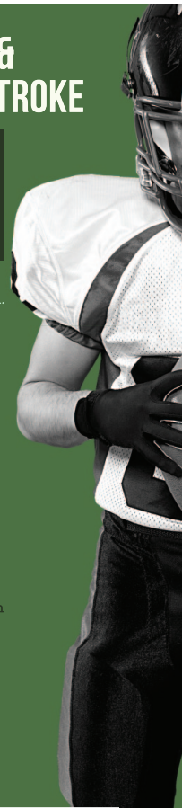
Figure 2. How coaches can help prevent EHS in their football athletes.

already elevated core temperature in an athlete with diminished capacity to shed metabolic heat.