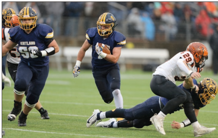
Kirtland returns to the state championship game in 2024, its eighth straight appearance in a state final and 13th since 2011. The Hornets have won seven state titles, and they enter the 2024 Division VI state championship game riding a 28-game winning streak.