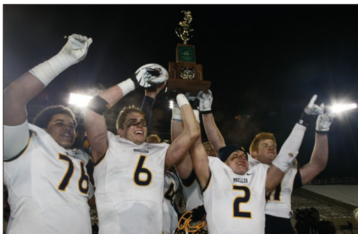
Cincinnati Archbishop Moeller has won nine state titles, third most in state history behind Maria Stein Marion Local (14) and Cleveland St. Ignatius (11), and the Crusaders are back in a state final for the first time since winning back-to-back state championships in 2012 and 2013. Above, Moeller raises the Division I state championship trophy in 2013.

Maria Stein Marion Local: 2021 (Div. VII, W), 2022 (Div. VI, W), and 2023 (Div. VII, W)